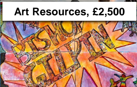
Art Resources, £2,500