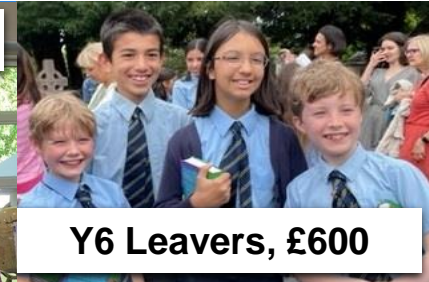
Y6 Leavers, £600