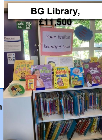
BG Library, £11,500