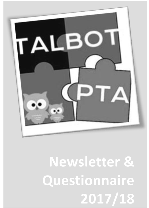
FUN AND FUNDRAISING FOR THE FAMILIES AND FRIENDS OF TALBOT PRIMARY SCHOOL