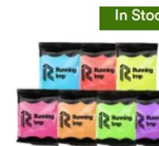
Colour Powder Pouches