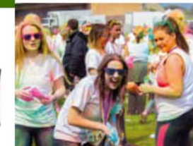
Plain White T-shirts